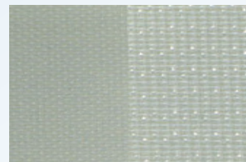
Permanent synthetic endless belt. Filtration to 40 micron.

An inclined backplate allows the chain and flight assembly to seal the media against the back wall of the filter, thus eliminating chip by-pass.